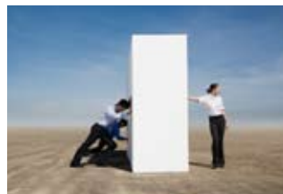
ANALYSIS TOOL: ACCOMPLISH MORE WITH LESS EFFORT

The Analysis Tool on SERION gives you intuitive and flexible search analysis and reporting possibilities that make you work better, faster and more efficiently. This Quick Reference Guide will lead you through some of the most important functionalities. To reach the Analysis Tool, go to compumark.thomson.com , fill in your username and password and choose 'inbox'. Click on the relevant citation to open your report in the Analysis Tool.